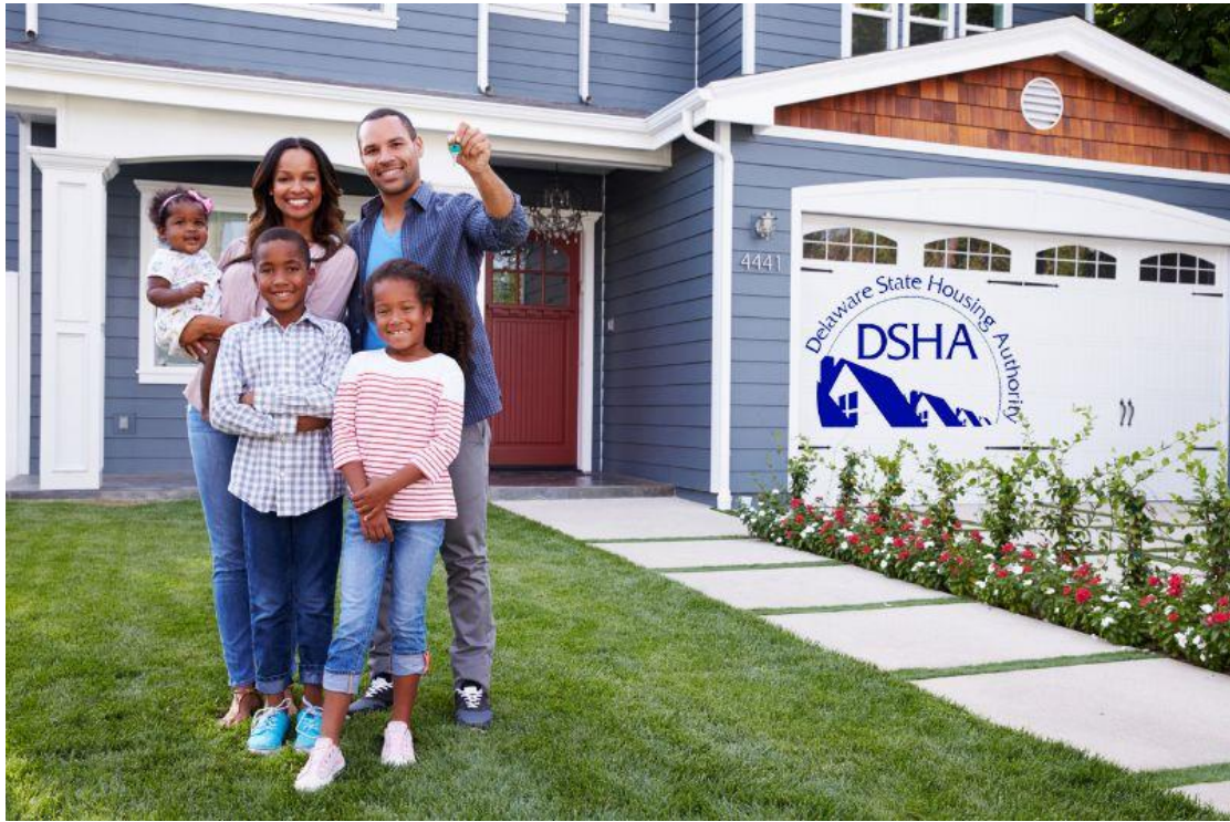
18 The Green, Dover, DE 19901